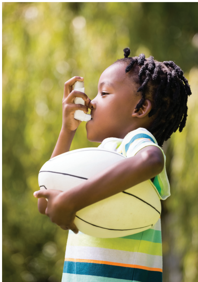
Air pollution exposure can lead to significant risk for developing respiratory disease and cancer. Children are especially vulnerable.

Children are especially vulnerable to the effects of toxic air pollution. In addition to daily exposure to toxic pollution in the