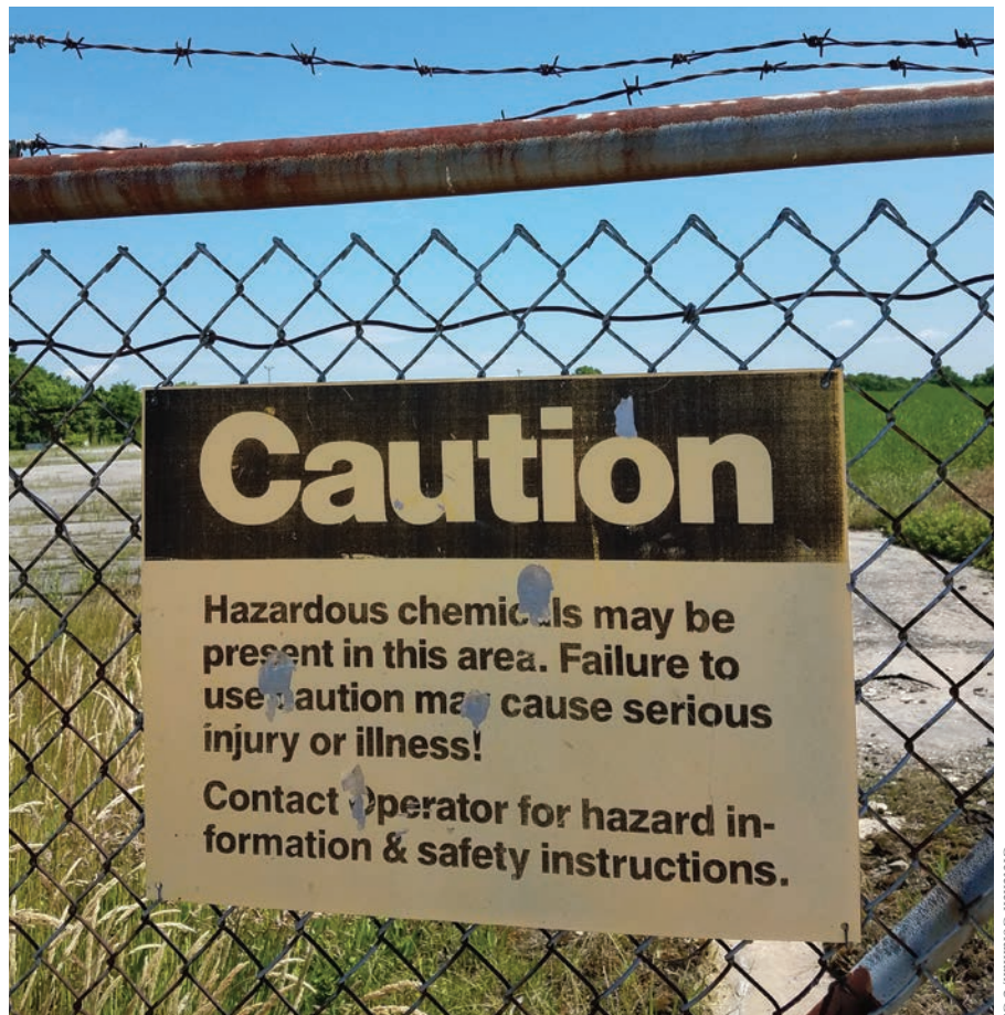
People of color and people in poverty are being disproportionately affected by air pollution in Delaware, due to the motor vehicles, power plants, and chemical facilities in their communities.