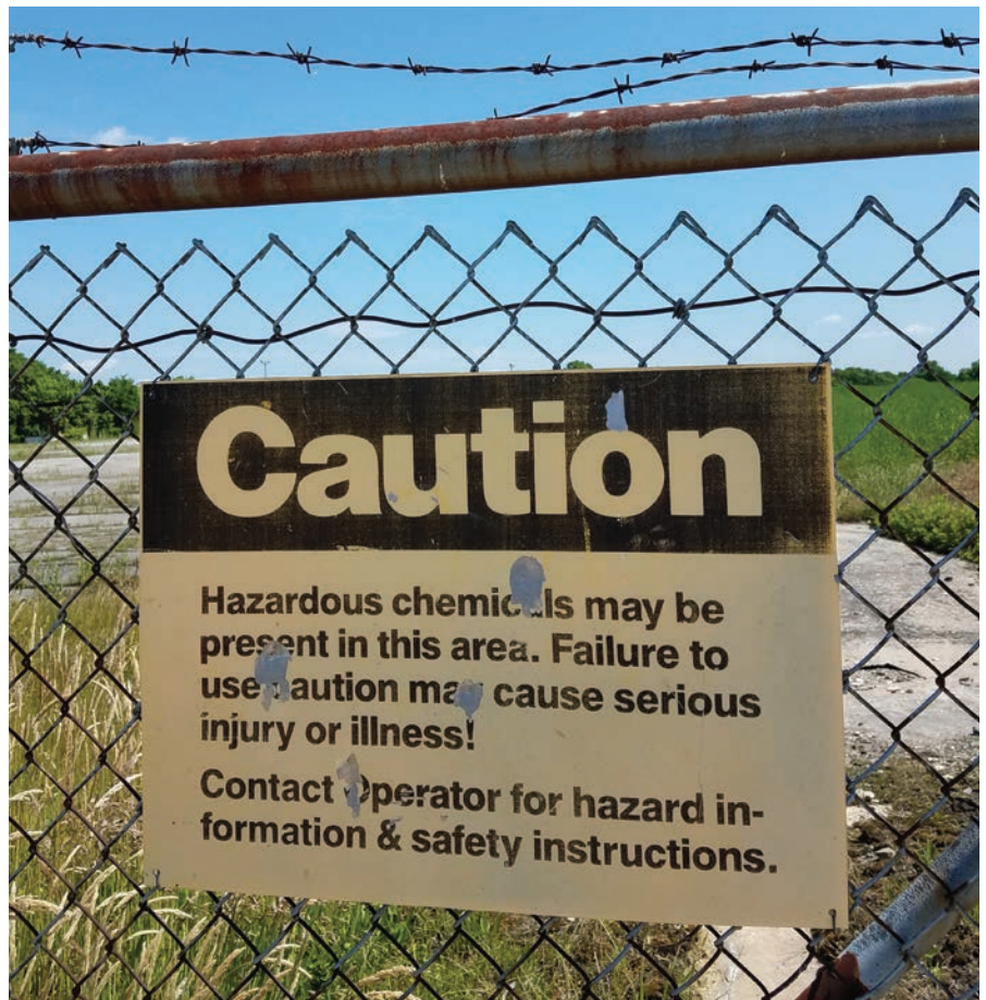
People of color and people in poverty are being disproportionately affected by air pollution in Delaware, due to the motor vehicles, power plants, and chemical facilities in their communities.